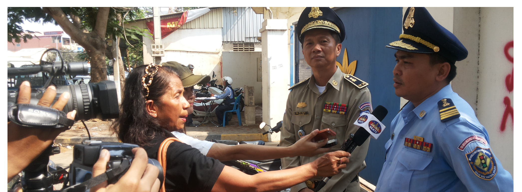
Agents for Change journalists discuss road safety issues in the country with Cambodian law enforcement officials.