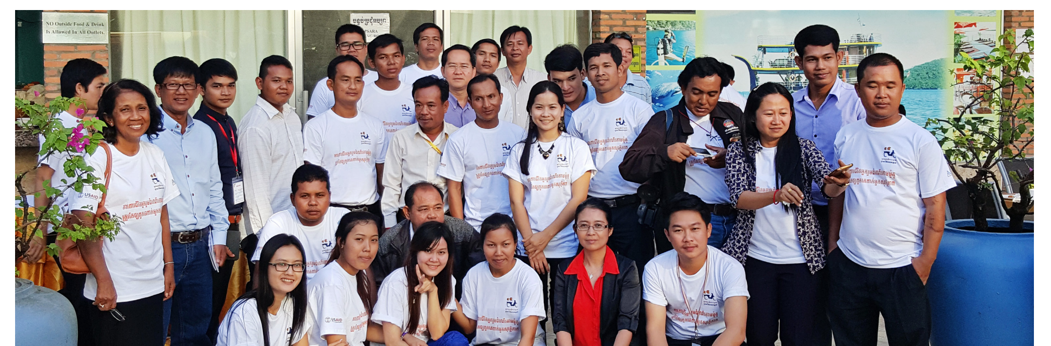
Journalists participate in a training workshop as part of the Agents for Change program.