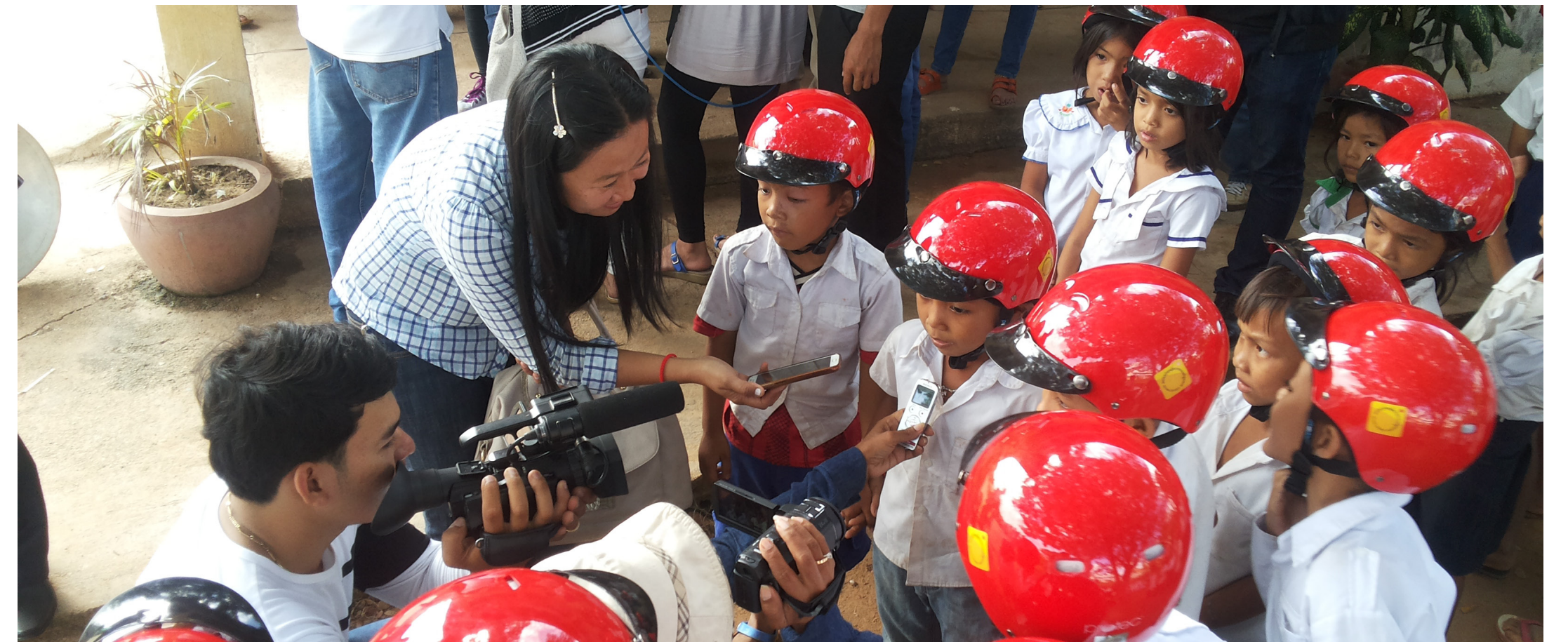
Reporters interview students about helmet safety.

83% reported being confident in applying what they learned to promote passenger helmet use .