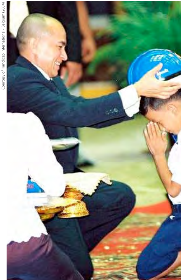
H.M. King Norodom Sihamoni endorses Protec helmets

In addition, CHVI provides technical assistance and capacity building to the Cambodian government, advocates for important legislation revisions, and engages traffic police in raising awareness among the public.