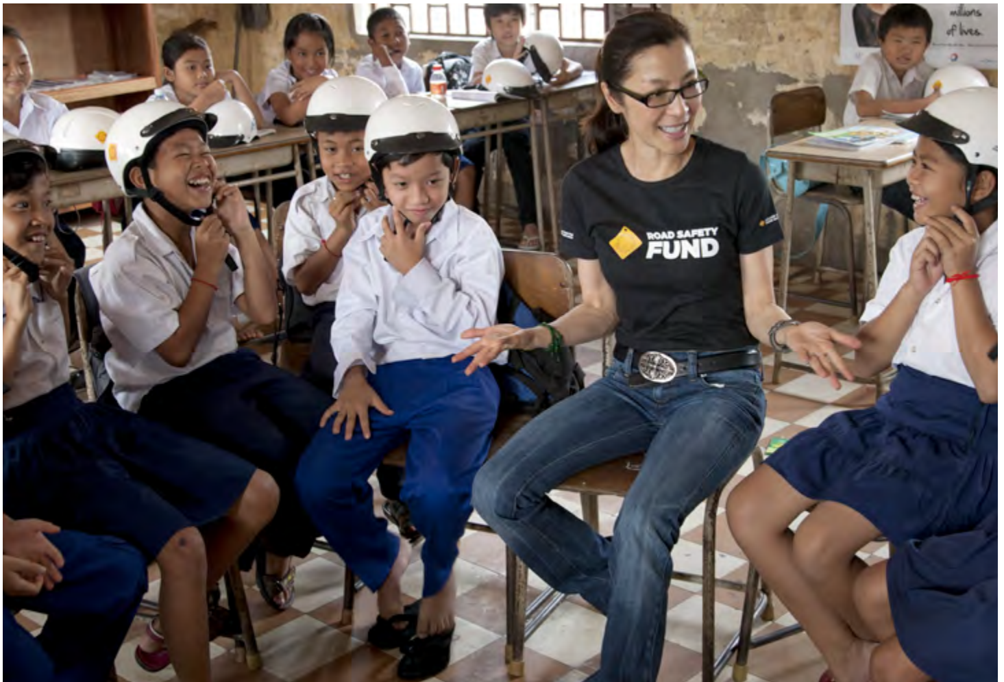
Actress and Global Road Safety Ambassador Michelle Yeoh meets with Cambodian students while producing documentary with CHVI

Early in the process of revising the helmet law, road safety stakeholders were alerted that children were not going to be included in the mandate for passenger helmet use and therefore would remain unprotected. In October 2011, AIP Foundation issued a call to road safety stakeholders to co-sign a letter to request inclusion of children in the draft. Signatories included HIB, Medical Teams International, Automobile Association of Cambodia, and Coalition for Road Safety to the Minister of Public Works and Transport. The Minister consented to the joint request and advised the Technical Working Group to include a requirement that children wear a helmet. This was officially included in the draft in November 2011, and a new law mandating both child and adult passenger helmet use is under review by the Council of Ministers at the time of the writing of this document.